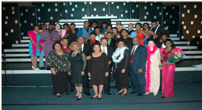
Cast, Theater Director, ULS & Foundation Board Members and Dinner- Theater Co-chairs (Left)