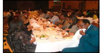
Faculty enjoy delicious meal at banquet